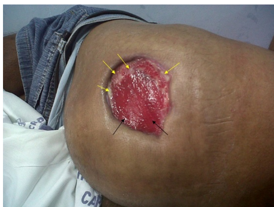
Figure 2. There is still gluteus maximus muscle exposure, but there is no longer any exudate or necrotic material and there has been a considerable reduction in the inflammatory process. In certain regions of the ulcer, fibrin production can be seen (yellow arrow).