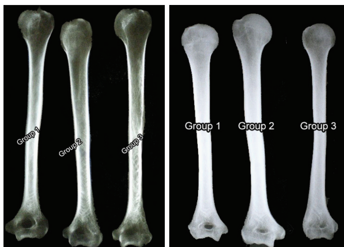
[Table/Fig-3]: STF radiolucency (Radiographic incidence of 45 kV and 0,05mAs).

*There is no difference between the three groups